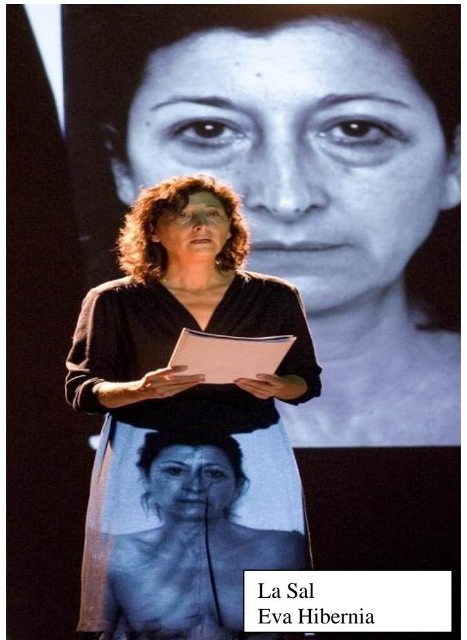
La Sal Eva Hibernia