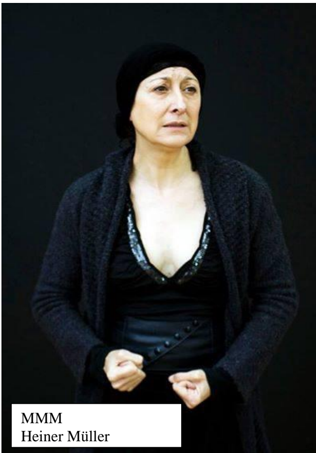
MMM Heiner Müller