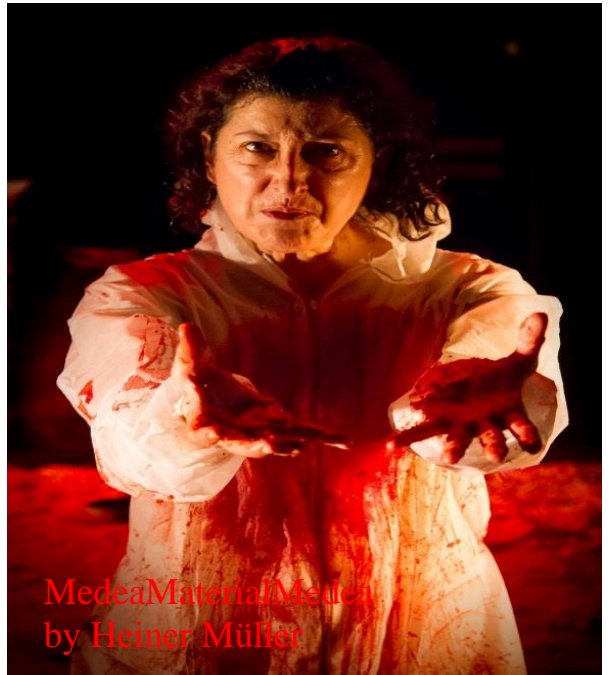
MedeaMaterialMedea by Heiner Müller